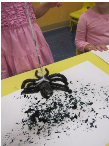
Creating our "spider art" last month!